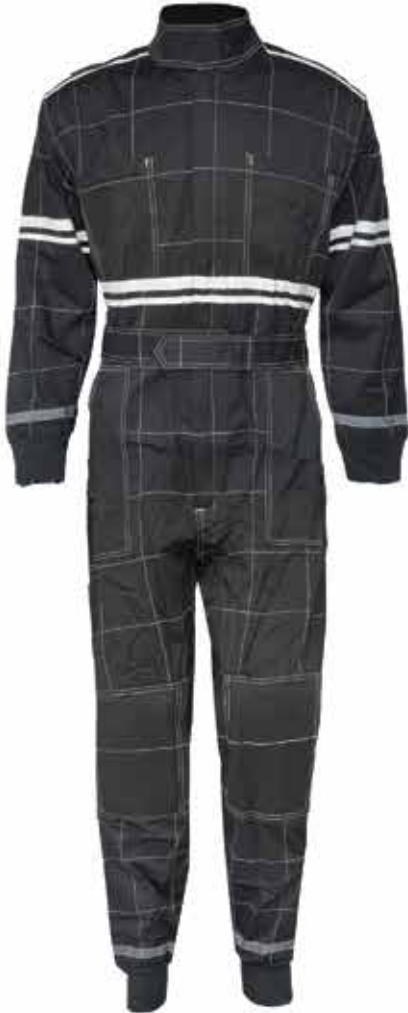
ISW - 754

Fabric: 100% Cotton, Size: XXS - XXL Colour: