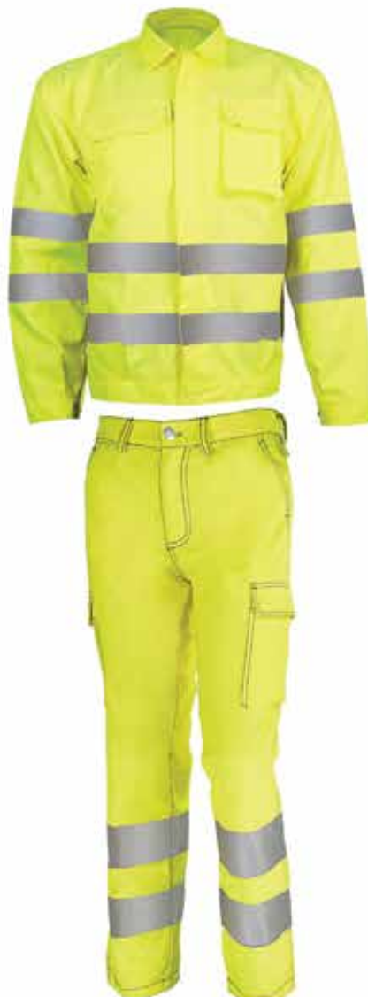
ISW - 731

60% Cotton, 40% Polyester, EN-20471 Class2 Size: XXS - XXL Colour: