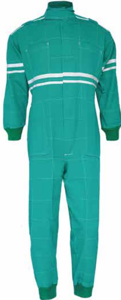
ISW - 752

Fabric: 100% Cotton, Size: XXS - XXL Colour: