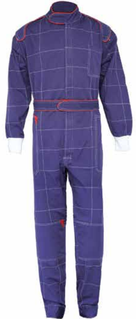
ISW - 751

Fabric: 100% Cotton, Size: XXS - XXL Colour: