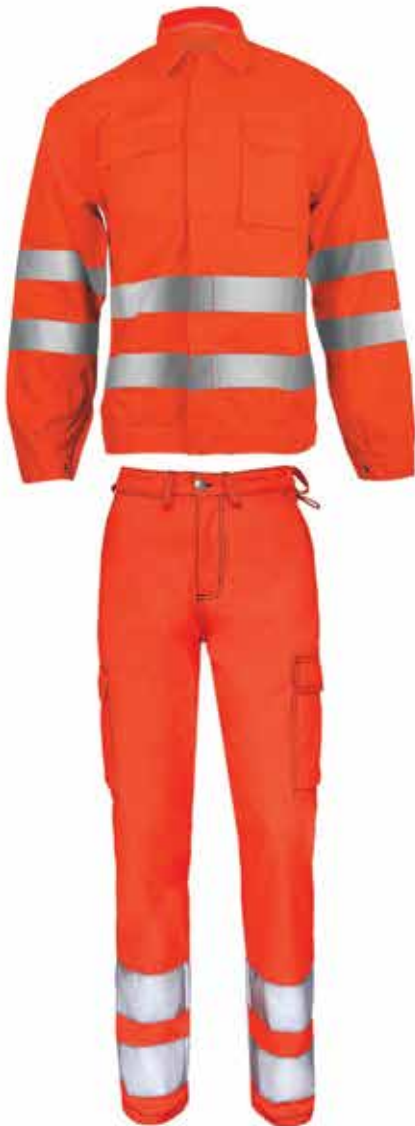
ISW - 730

60% Cotton, 40% Polyester, EN-20471 Class2 Size: XXS - XXL Colour: