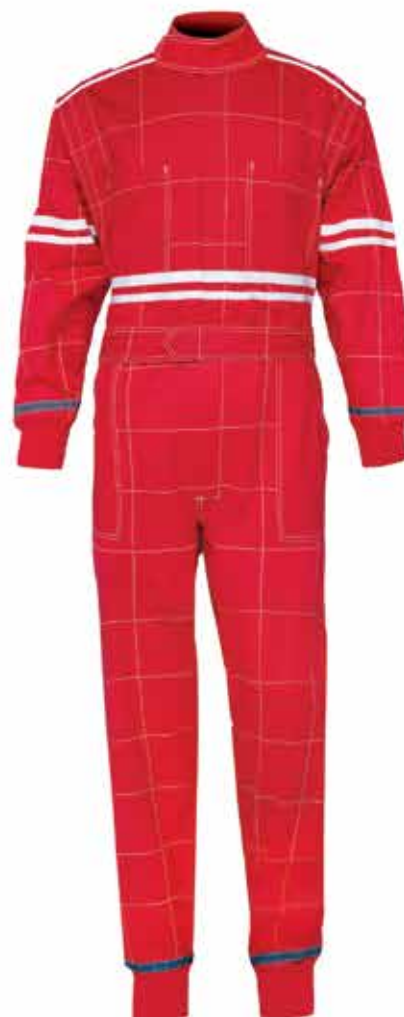
ISW - 754

Fabric: 100% Cotton, Size: XXS - XXL Colour: