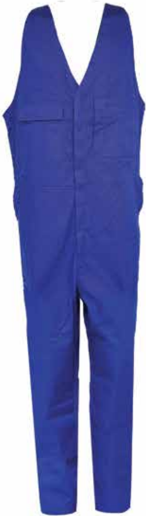
ISW - 706

Fabric: 100% Cotton, Size: XXS - XXL Colour: