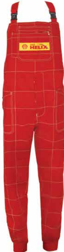
ISW - 707

Fabric: 100% Cotton, Size: XXS - XXL Colour: