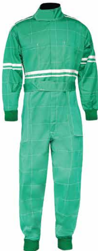
ISW - 753

Fabric: 100% Cotton, Size: XXS - XXL Colour: