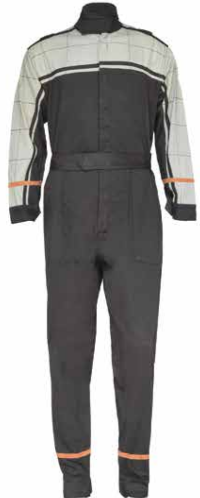
ISW - 753

Fabric: 100% Cotton, Size: XXS - XXL Colour: