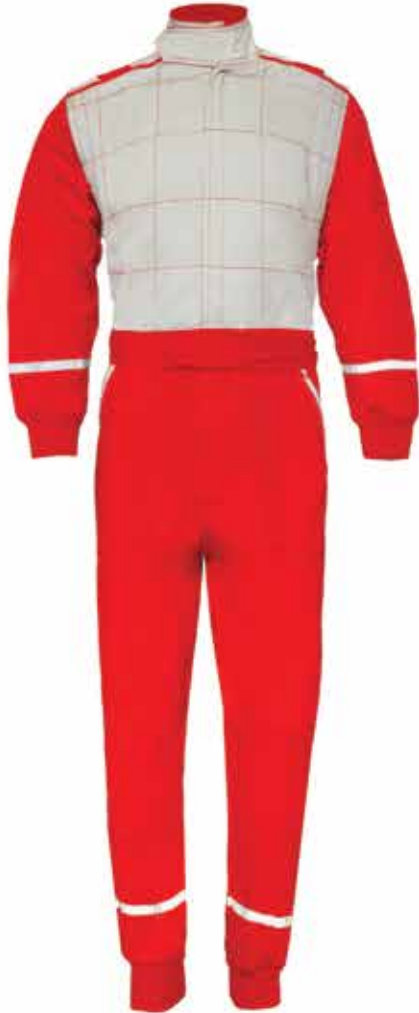
ISW - 751

Fabric: 100% Cotton, Size: XXS - XXL Colour: