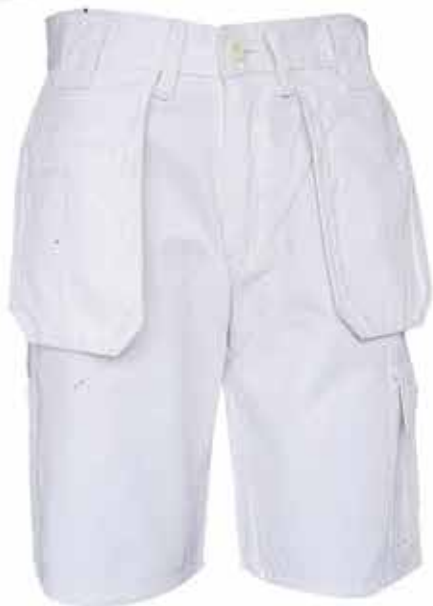
ISW - 726