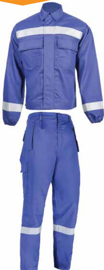
ISW - 749

FR Suit 100% Cotton, FRC with reflective EN ISO 11612:2015(A1,A2,B1,C1,F1) EN ISO 15025: 2016 Size: XXS - XXL Colour: ■ ■ ■