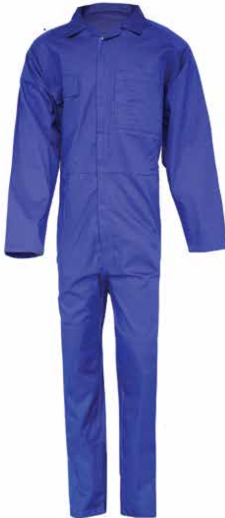
ISW - 702

Fabric: 65% Cotton, 35% Polyester, Size: XXS - XXL Colour: