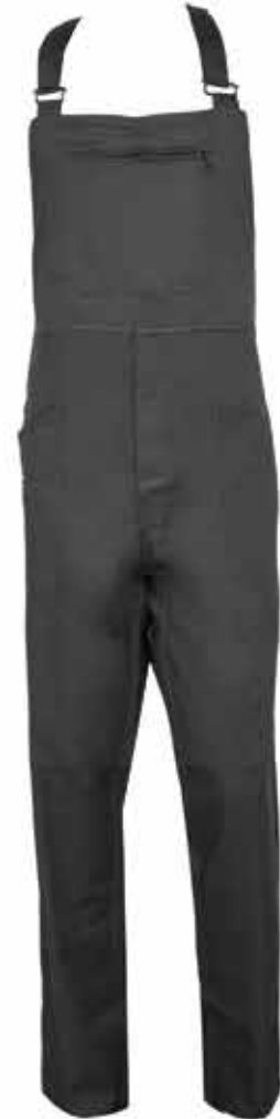
ISW - 708

Fabric: 100% Cotton, Size: XXS - XXL Colour: