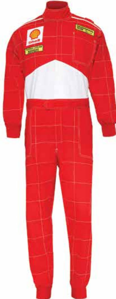
ISW - 755

Fabric: 100% Cotton, Size: XXS - XXL Colour: