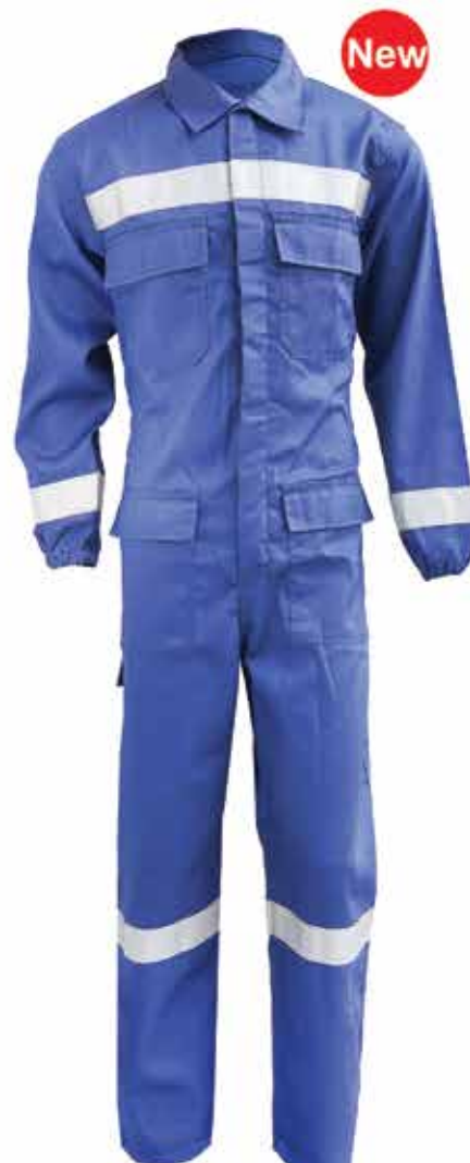
ISW - 750

FR Suit 100% Cotton, FRC with reflective EN ISO 11612:2015(A1,A2,B1,C1,F1) EN ISO 15025: 2016 Size: XXS - XXL Colour: ■ ■ ■