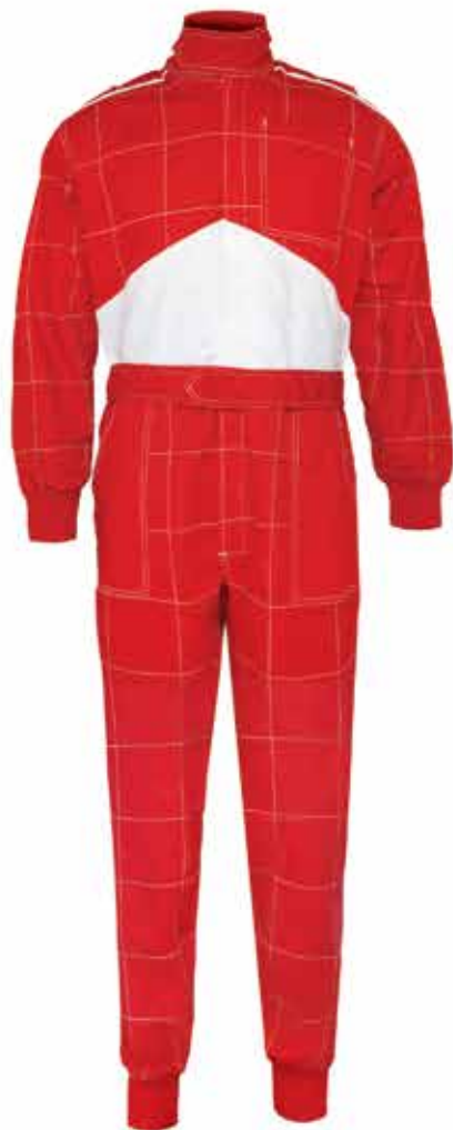
ISW - 752

Fabric: 100% Cotton, Size: XXS - XXL Colour: