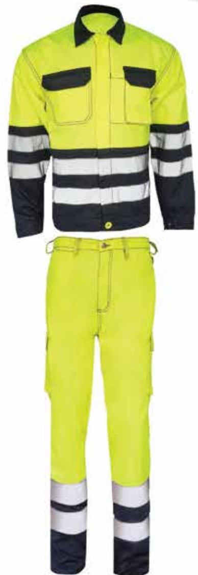
ISW - 732

60% Cotton, 40% Polyester, EN-20471 Class2 Size: XXS - XXL Colour: