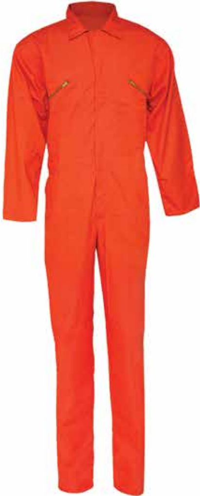
ISW - 701

Fabric: 65% Cotton, 35% Polyester, Size: XXS - XXL Colour: