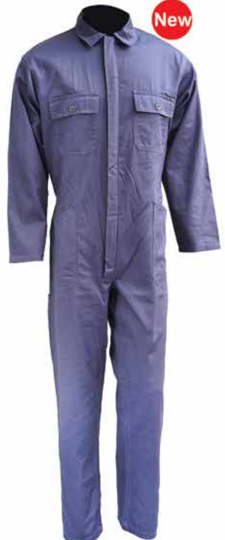
ISW - 703

Fabric: 65% Cotton, 35% Polyester, Size: XXS - XXL Colour: