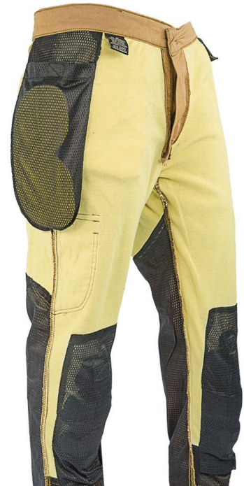
FG-MJ-08-24 Color: Mustard Size: 32" to 46"

Outer Shell | 98% Cotton, 2% LYCRA (Power Stretch). Inner Lining | 40% Kevlar® Fiber, 60% Polyester. Inner | 100% Polyester Mesh.