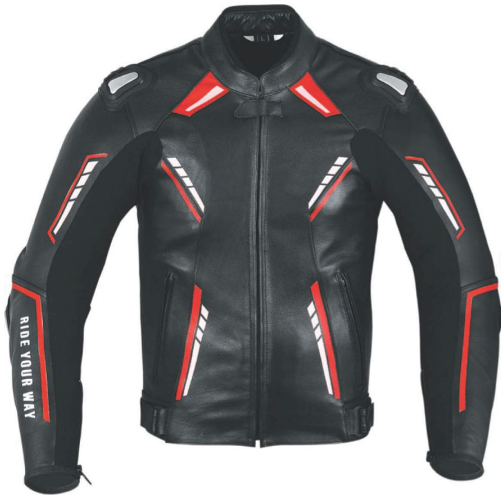
FG-RLJ-10-24 Color: Black & Red Size: S to 2XL

Body | Cow Plated Lining | Fix 100% Polyester Mesh