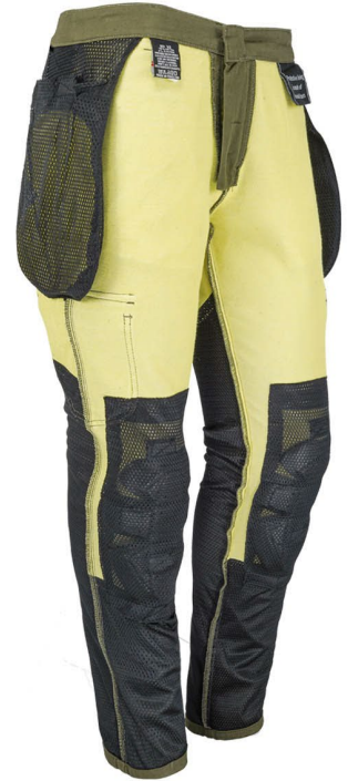
FG-MJ-07-24 Color: Green Size: 32" to 46"

Outer Shell | 98% Cotton, 2% LYCRA (Power Stretch). Inner Lining | 40% Kevlar® Fiber, 60% Polyester. Inner | 100% Polyester Mesh.