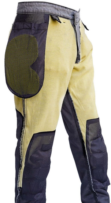
FG-MJ-06-24 Color: Bob Grey Size: 32" to 46"

Outer Shell | 98% Cotton, 2% LYCRA (Power Stretch). Inner Lining | 40% Kevlar® Fiber, 60% Polyester. Inner | 100% Polyester Mesh.