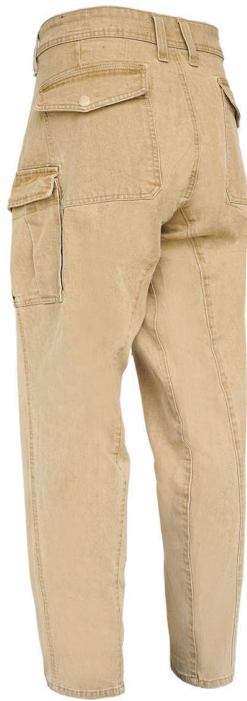
FG-MJ-03-24 Color: Khaki Ride Size: 32" to 46" Certified | CE AAA Certified Washing | Bio-Based Wasing, Laser Whisker Composition | Cotton / Dyneema