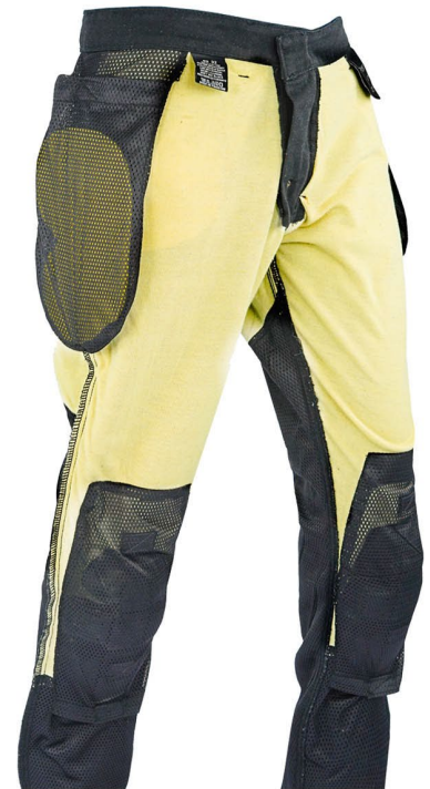
FG-MJ-11-24 Color: Black Size: 32" to 46"

Outer Shell | 98% Cotton, 2% LYCRA (Power Stretch). Inner Lining | 40% Kevlara® Fiber, 60% Polyester. Inner | 100% Polyester Mesh.