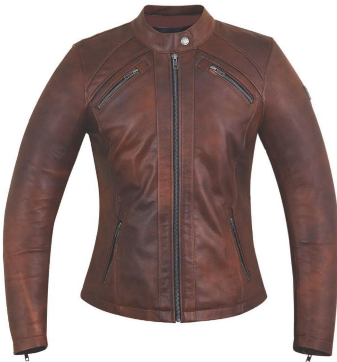
FG-WJ-16-24 Color: Brown Size: S to XL

Body | Goat Leather Lining | Fix 100% Polyester