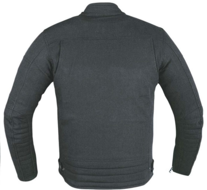
FG-MJ-01-24 Color: Dark Grey Size: S to 2XL

Body | 75% Cotton, 25% Polyester Sulfur Canvas