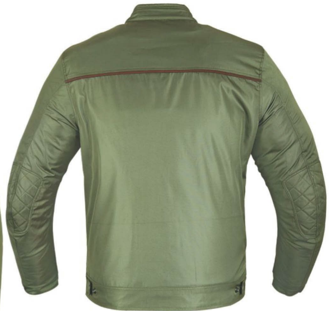
FG-MJ-17-24 Color: Green Size: S to XL

Body | 100% Nylon Taslan Lining | Fix 65% Cotton, 35% Polyester Liner | Detachable Quilt 100% Polyester