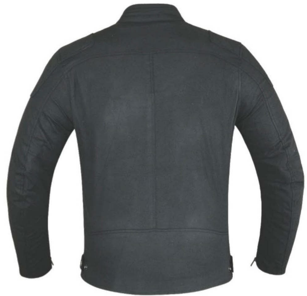
FG-MJ-03-24 Color: Dark Grey Size: S to 2XL

Body | 70% Cotton, 30% Polyester Oily Canvas