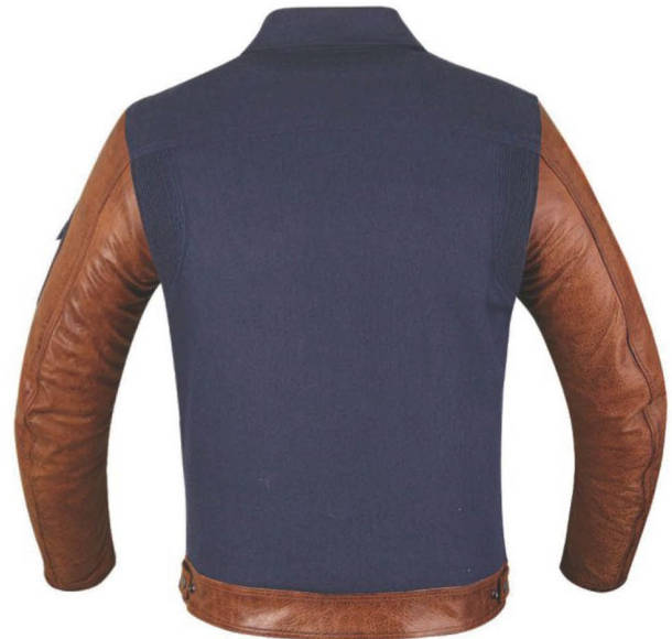
FG-MJ-04-24 Color: Brown & Blue Size: S to 2XL

Body | 50% Cotton, 20% Polyester 30% Buffalo Leather / Elastance Poly Dyed Canvas