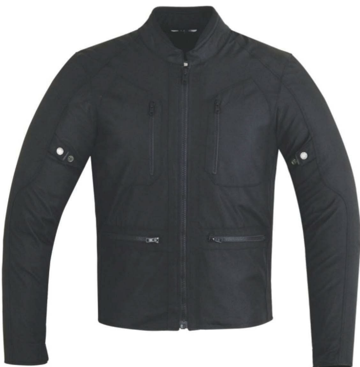
FG-RTSJ-06-24 Color: Black Size: S to 2XL

Other Features | Original YKK Zippers Protection | CE Approved Elbow and Shoulder Level-1, Back Protection Level-1