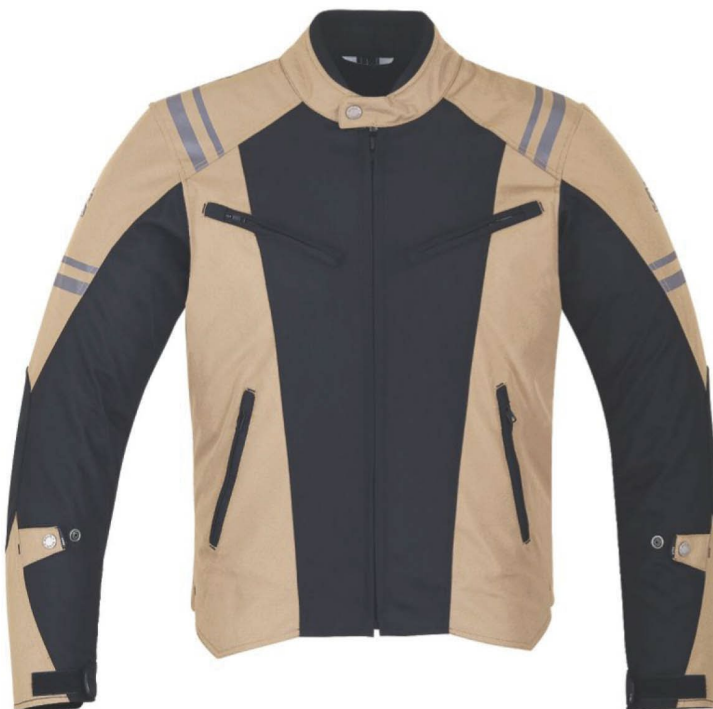
FG-RTSJ-04-24 Color: Black & Skin Size: S to 2XL

Other Features | Original YKK Zippers Protection | CE Approved Elbow and Shoulder Level-1, Back Protection Level-1