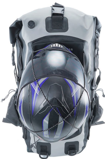
Waterproof Sack Backpack