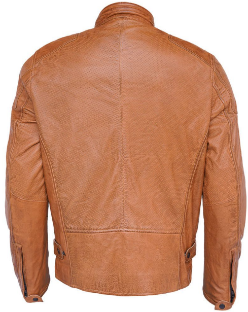
FG-MJ-07-24 Color: Lambskin Size: S to 2XL

Body | COW Hide, Perforated Natural Leather Lining | Fix 65% Cotton 35% Polyester Liner | Detachable Quilt 100% Polyester