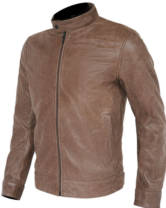
FG-MJ-10-24 Color: Brown Size: S to 2XL

Other Features | Original YKK Zippers Protection | CE Approved Elbow and Shoulder Level-1, Back Protection Level-1