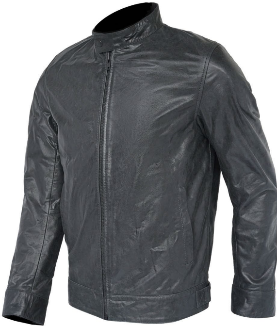
FG-MJ-09-24 Color: Black Size: S to 2XL

Body | COW Hide, Oakwood Leather Lining | Fix 65% Cotton 35% Polyester Liner | Detachable Quilt 100% Polyester