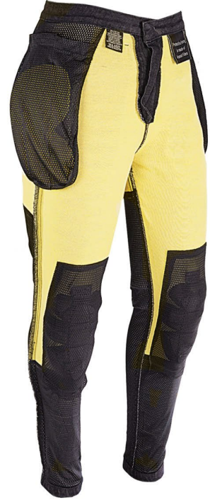
FG-WJ-09-24 Color: Dark Grey Size: 6" to 18"