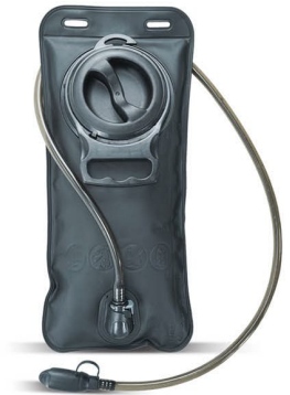
Water Sack Bottle