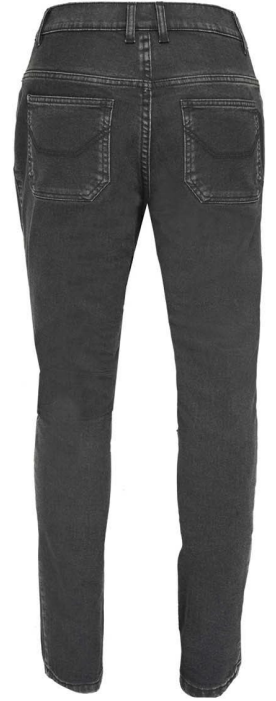
FG-MJ-02-24 Color: Midnight Black Size: 32" to 46" Certified | CE AAA Certified, Laser Whisker Washing | Bio-Based Wasing Composition | Cotton / Cordura / Spertra®