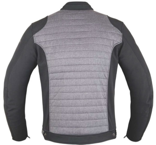
FG-MJ-05-24 Color: Black & Grey Size: S to 2XL

Body | 100% Polyester Lining | Fix 100% Polyester Mesh