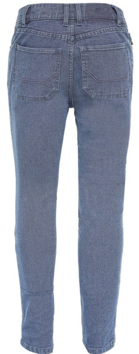
FG-MJ-04-24 Color: Skye Blue Size: 32" to 46" Certified | CE AAA Certified Washing | Bio-Based Wasing Composition | Cotton / Cordura / Kevlar®