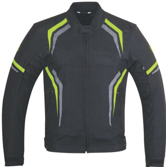
FG-RTSJ-05-24 Color: Black & Green Size: S to 2XL

Body | 100% Polyester Lining | Fix 100% Polyester Mesh Liner | Detachable Quilt 100% Polyester