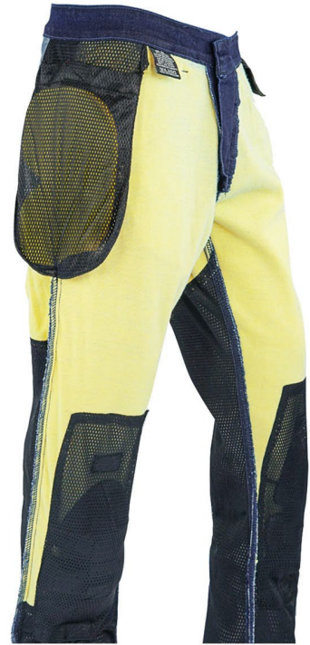
FG-MJ-05-24 Color: Dark Blue Size: 32" to 46"

Outer Shell | 98% Cotton, 2% LYCRA (Power Stretch). Inner Lining | 40% Kevlar® Fiber, 60% Polyester. Inner | 100% Polyester Mesh.