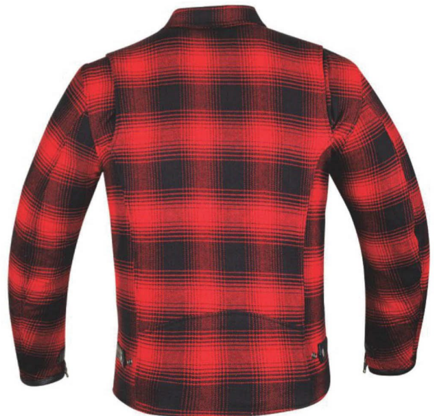
FG-MJ-02-24 Color: Red & Black Size: S to 2XL