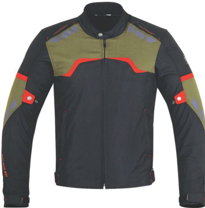
FG-RTSJ-03-24 Color: Black & Green Size: S to 2XL

Body | 100% Polyester Lining | Fix 100% Polyester Mesh Liner | Detachable Quilt 100% Polyester