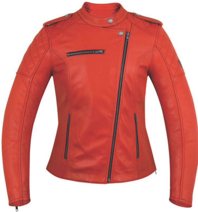
FG-WJ-15-24 Color: Red Size: S to XL

Body | Goat Leather Lining | Fix 100% Polyester