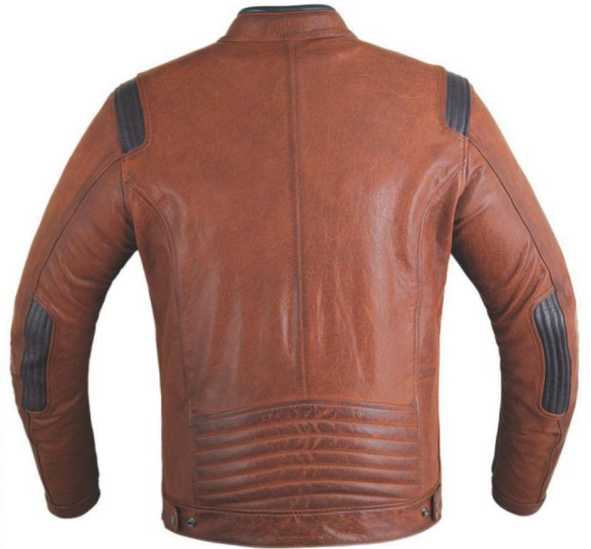
FG-MJ-11-24 Color: Brown & Black Size: S to 2XL

Body | COW VEG Lining | Fix 65% Cotton 35% Polyester Liner | Detachable Quilt 100% Polyester