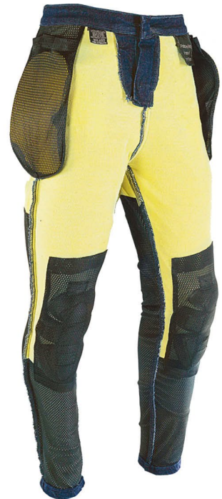
FG-WJ-10-24 Color: Sea Blue Size: 6" to 18"