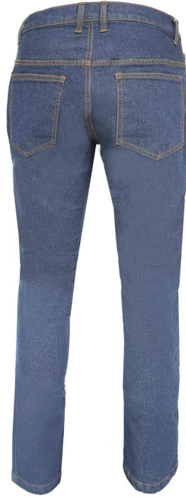
FG-MJ-01-24 Color: Porto Blue Size: 32" to 46" Certified | CE AA Certified, Washing | Bio-Based Wasing, Laser Whisker Composition | Cotton / Cordua / HPPE