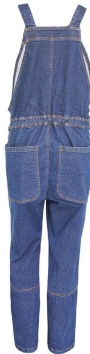
FG-MBT-12-24 Color: Blue Size: 32" to 46"

Outer Shell | 98% Cotton, 2% LYCRA (Power Stretch). Inner Lining | 40% Kevlara® Fiber, 60% Polyester. Inner | 100% Polyester Mesh.