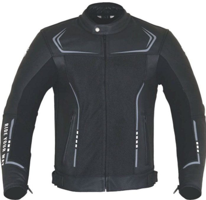
FG-RLJ-11-24 Color: Black & Grey Size: S to 2XL

Other Features | Original YKK Zippers Protection | CE Approved Elbow and Shoulder Level-1, Back Protection Level-1