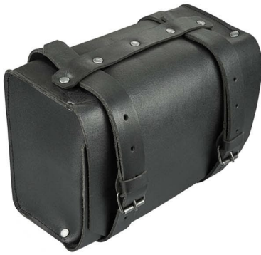
Leather Tool Bag