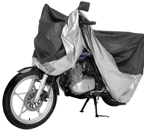
Motorcycle Sun and Rain Cover